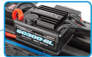
Water-resistant high-power Reedy brushless speed control