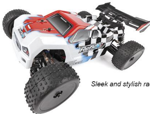
Sleek and stylish race-inspired body

Due to ongoing R&D, photos may not match final vehicle.