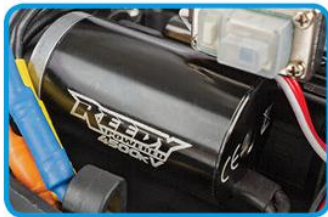
Powerful Reedy 4500kV Brushless Motor