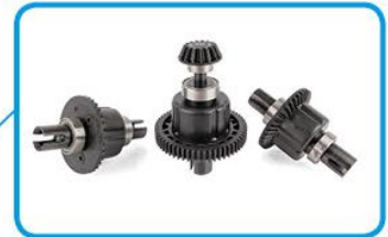
Three sealed differentials