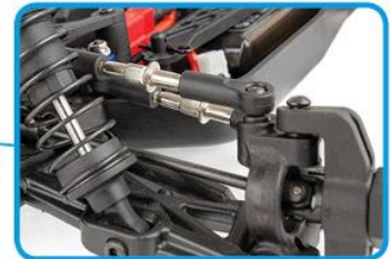
Adjustable turnbuckles and aluminum steering rack