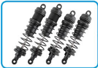
Threaded, coil-over shock absorbers