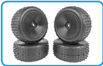
Off-road 12mm hex drive wheels with high-grip racing tires