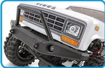
2-Piece High-Intensity LED Set and off road bumper