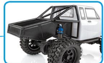
Molded rear cage with hinged body mount