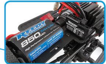
Reedy Power Water Resistant Speed Control, 380 Motor, and 850mah Li-Ion Battery