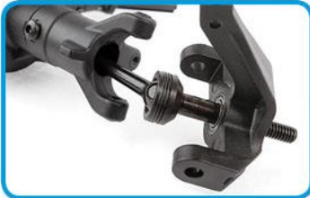
Metal Front CVA Axle Shafts