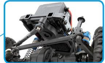
Chassis Mounted Steering (CMS) Servo