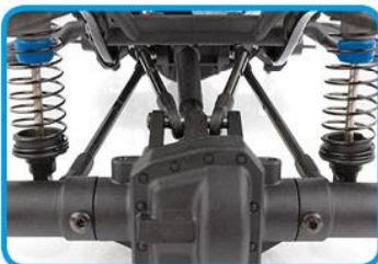
Metal 4-Link Front and Rear Suspension