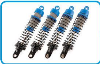
Fully Adjustable Threaded Fluid-Filled Shocks