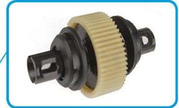
Differential height adjustment with included 0, 1, 2, and 3mm inserts