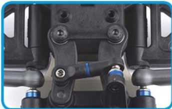
Reverse bellcrank steering allows more room for mounting electronics