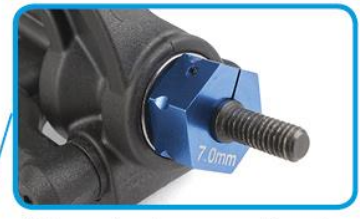
7.0mm aluminum rear clamping hex with laser etching