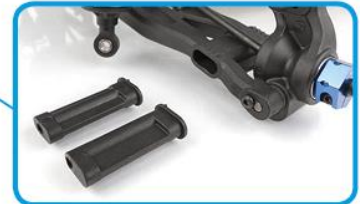
Innovative rear arm with molded inserts for ultra-fine lower shock mounting adjustments