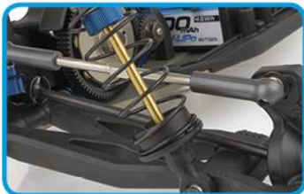
Heavy-duty rear axle with 91mm CVA bones