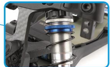
V2 12mm Big Bore threaded aluminum shocks with 3mm shafts and X-rings for improved smoothness

Due to ongoing R&D, photos may not match final kit. Vehicle shown equipped with items NOT included in kit: Reedy #260 motor, #27323 battery, #27004 ESC, #27101 servo, receiver, wheels, tires, body, and pinion gear. Assembly and painting required.