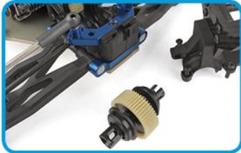
Easy access to ball differential