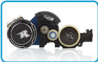
Layback Stealth® transmission for lower and more rearward CG