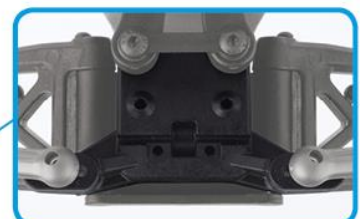
Front and rear anti-roll bar integration makes tuning easy