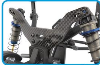
Heavy-duty routed graphite shock towers