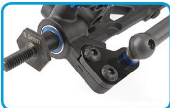
Bolt-on steering block arms for easy Ackermann adjustments