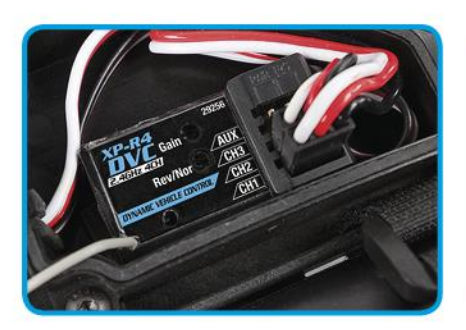
New DVC (Dynamic Vehicle Control) receiver featuring built-in adjustable gyro