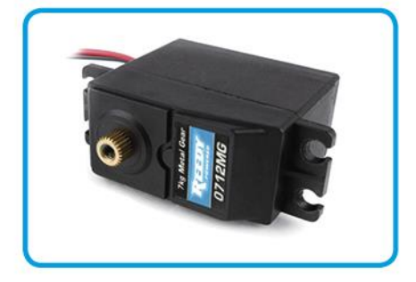
Metal-gear, digital, high-torque Reedy servo