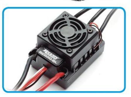
Water-resistant Reedy brushless electronic speed controller with High Current T-Plug