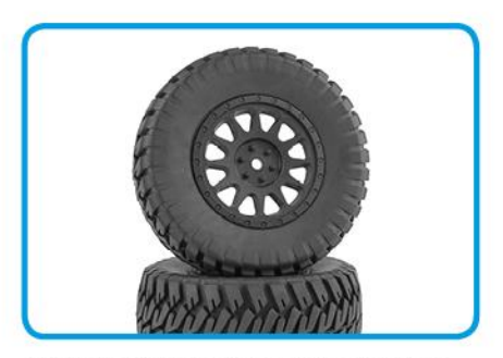
High-traction racing compound tires mounted on hex drive wheels