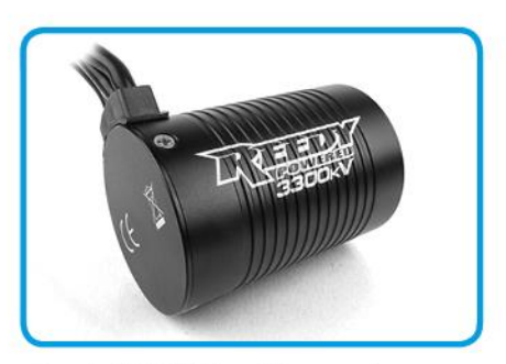
Reedy 3300kV brushless motor