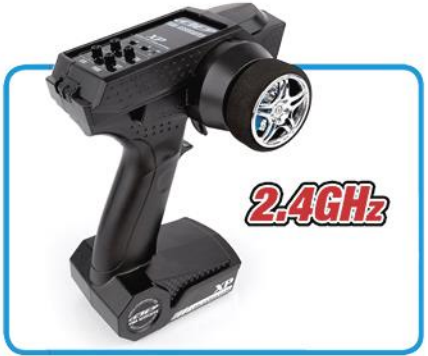
XP 2.4GHz radio system