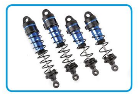
Fluid-filled, blue anodized aluminum V2 Big Bore shock bodies, front and rear