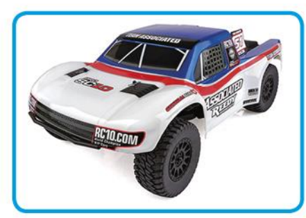
Alternate body scheme: #70016 ProSC10 AE Team