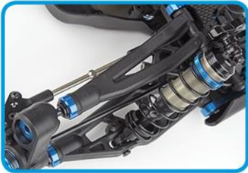
Strengthened front upper suspension arms for improved durability