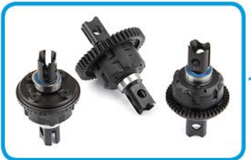
V3 differentials with H.T.C. (High Torque Capacity) internal gears offer increased fluid capacity and more consistent feel lap after lap