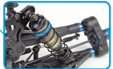
16mm Big Bore 6061 aluminum shock bodies and bleeder-style caps, with new 20mm I.D. springs