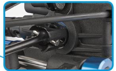
Updated gearbox reduces differential movement for a more consistent gear mesh