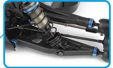
133mm CVA driveshafts increase traction and chassis support