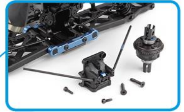
Easily accessible front and rear differentials