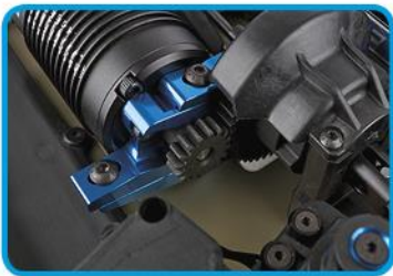
Two-piece sliding motor mount for easy gear mesh adjustment and motor removal