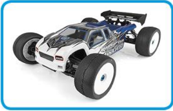
Pro-Line® Predator body included