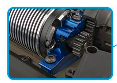
Two-piece sliding motor mount for easy gear mesh adjustment and motor removal