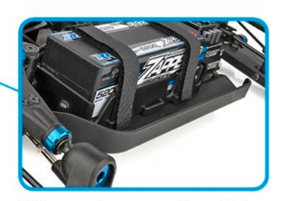
Side guards are now threaded into the chassis from the top side of the car